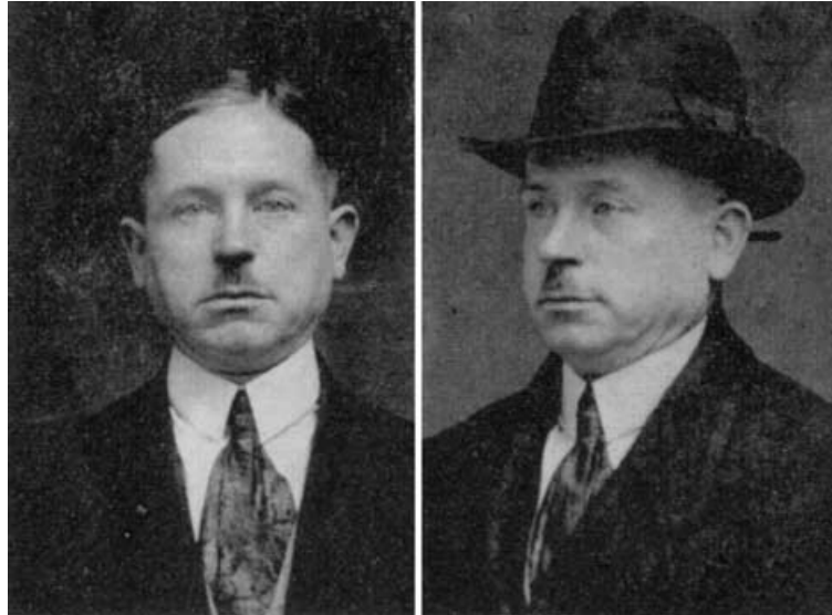
Fig. 2. Mugshot of Peter Kuerten, the homicidal 'vampire of Düsseldorf': a photograph contains much more information about a person's physical, social and mental condition than a DNA fingerprint from non-coding, intronic regions (photo: Archive Benecke).

In other cases, DNA typing is just a tool for identification. DNA profiles from unidentified bodies or body parts are collected and stored even without any specific consent. Eventually, all genetic fingerprints, irrespective of their origin, are destroyed after a fixed interval of time just like any other information in the legal system of democratic countries.